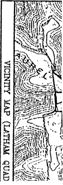
VICINITY MAP (LATHAM QUAD)