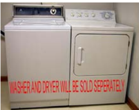
WASHER AND DRYER WILL BE SOLD SEPARATELY

This wooded 5.56+/- acre lot with a 2802 sq ft 2 story home at the end of a paved road offers privacy & possible spectacular views. A paved circular drive, 4 bedrooms, 2 1/2 baths, with a hobby room. There is a living room, dining room, large open family room & eat in kitchen combo with a sizeable screened in porch, laundry room, 2 car garage and a walk out basement. The home has hardwood and carpet floors. The design offers one level living—big master bedroom suite with a spacious master bath. Home is close to Vinton and Roanoke.