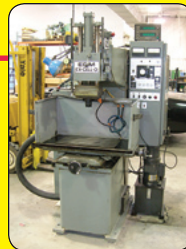
Excello 251 Toolroom EDM (1 of 2)