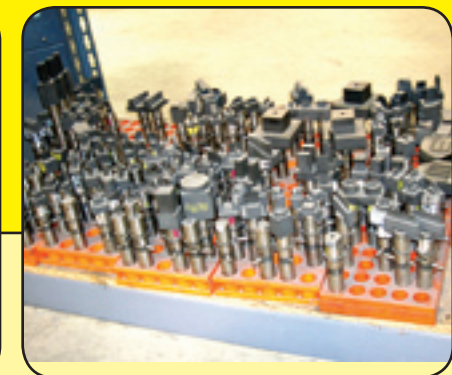
3R Tooling (Partial View)