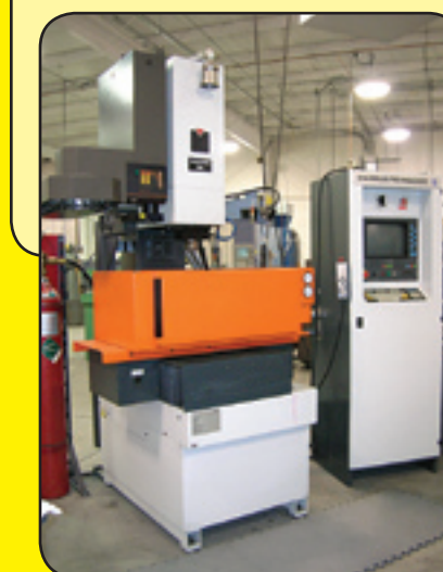
Charmilles Roboform 20A CNC Sinker EDM with C-Axis, New 1997

OKK Model DGM-400 CNC Graphite VMC, 2001 • Haas VF-3 Okuma MC-3VA • Charmilles Roboform 40 CNC EDM • Charmilles Roboform 20A CNC EDM Okamoto 12-24DX Surface Grinder • Cincinnati/Fanuc Roboshot 110i CNC Plastic Molder, 2001 Toolroom • Mills • Lathe • Grinders • Molding Machines • Forklift • Deltronics Comparator • Ford Stake Bed Truck Large Quantity Tooling and Inspection Items