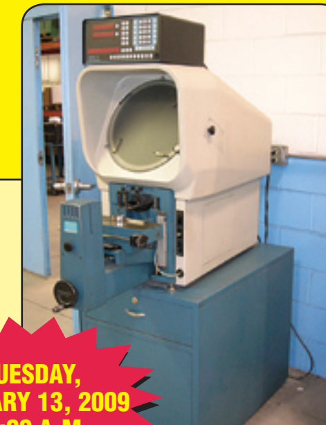
Deltronic DH14-MPC Optical Comparator