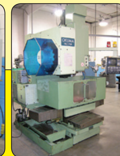
Okuma Model MC3-VA Vertical Machining Center

DIRECTIONS: From I-70 in Northeast Dayton area, Take Exit 41 (Westbound I-70) or Exit 41B (Eastbound I-70), State Route 235 North/New Carlisle. Go North on Route 235, 2/10 Mile to Center Point 70 Boulevard. Turn Left (West) onto Center Point 70 Boulevard, go 1 2/10 Mile to Auction Site, Right Hand Side, 7601 Center Point 70 Boulevard. Watch for Signs!