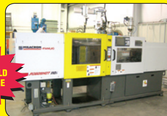
Milacron/Fanuc Model Roboshot 110i Plastic Molder, Electric, New 2001

BUSINESS CLOSED • EXCELLENT CONDITION MOLD AND TOOL & DIE FACILITY