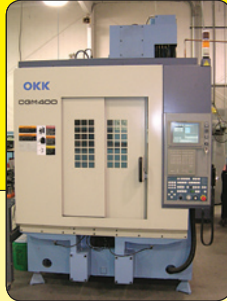
OKK DGM-400 CNC Hi Speed Graphite Vertical Machining Center, New 2001