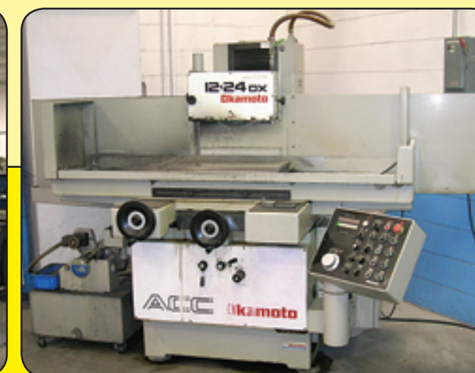
Okamoto Model 12-24DX 3-Axis Surface Grinder