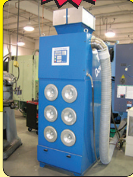
Torit SDF-6 Cartridge Type Dust Collector with Checkboard Control