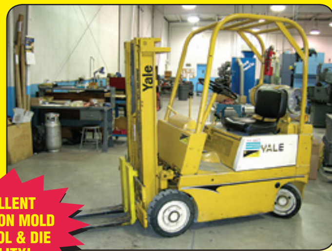
Yale 5,000 Lb. Capacity Fork Lift

EXCELLENT CONDITION MOLD AND TOOL & DIE FACILITY!