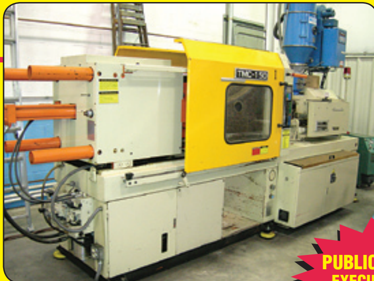
TMC 150 Ton Plastic Injection Molding Machine