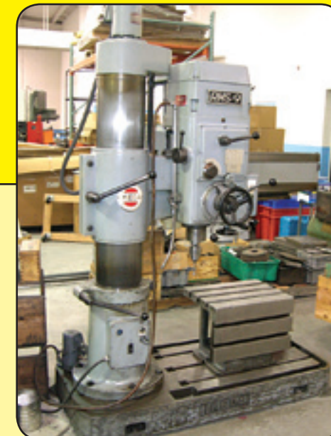
Ikeda 3' X 9" Radial Arm Drill