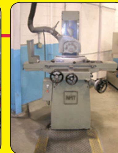
MHT 6" X 18" Surface Grinder