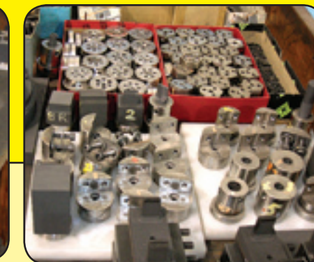
3R Tooling (Partial View)