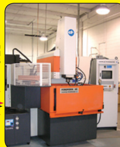
Charmilles Roboform 40 CNC Sinker EDM with C-Axis, New 1995

EXCELLENT CONDITION MOLD AND TOOL & DIE FACILITY!