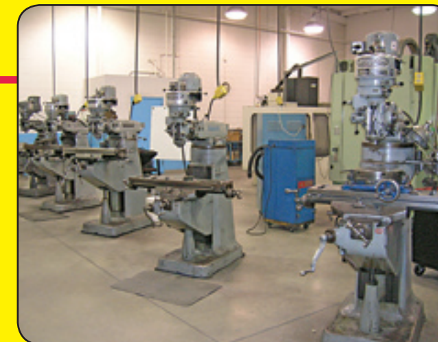
Bridgeport Mills (4 Available)