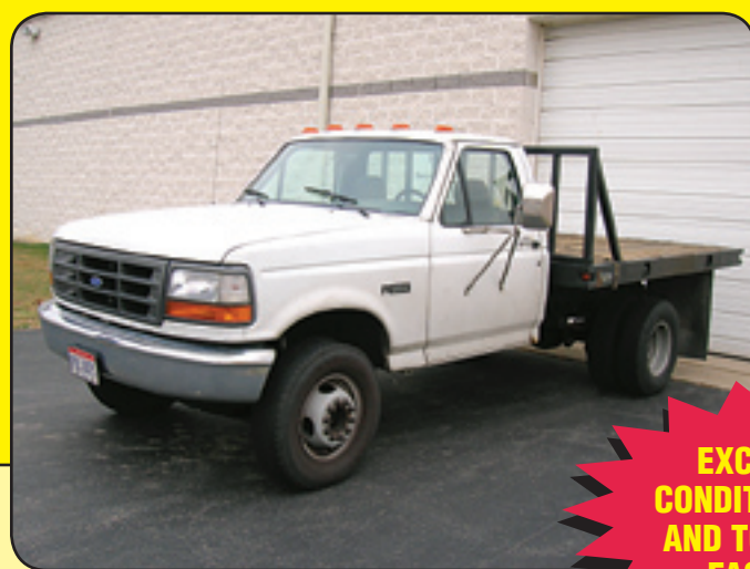
1993 Ford Stake Bed Truck