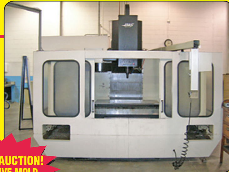
Haas Model VF-3 Vertical Machining Center

PUBLIC AUCTION! EXECUTIVE MOLD CORPORATION