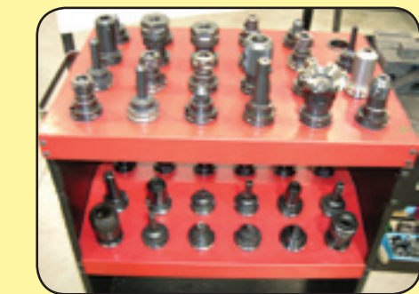
Cat 40 Tooling (Partial View)