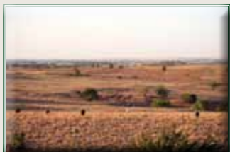
Excellent Cropland and Grassland!