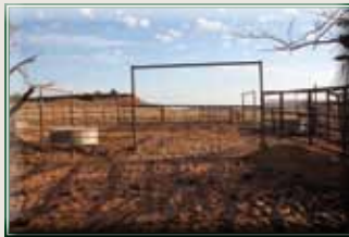
Catch Pen and Stock Water!