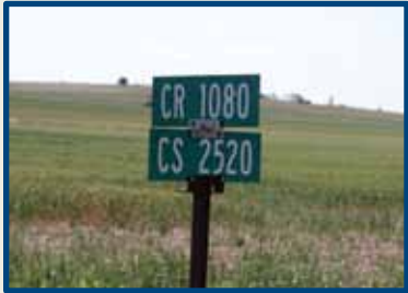
Blacktop Road Access!