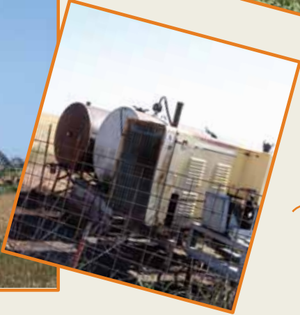
T-L Center Pivot!

Terms & Conditions: 10% of the purchase price of the real estate will be deposited in escrow the day of sale with the balance due upon closing. The Seller will have a reasonable period of time to furnish the abstract. The Buyer will have 15 days to examine the abstract and closing will be within 5 days of acceptance of title. Possession will be upon closing. Selling surface only. Maps/pictures are for reference only. Any announcements sale day take precedence. This property sells subject to confirmation by the Seller.