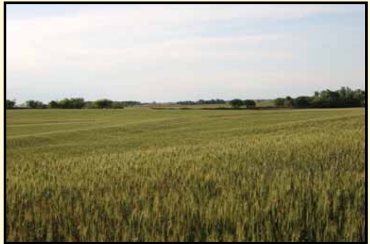
Productive Irrigated Farmland!