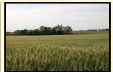
750 GPM Irrigation Well!

Terms & Conditions: 10% of the purchase price of the real estate will be deposited in escrow the day of sale with the balance due upon closing. The Seller will have a reasonable period of time to furnish the abstract. The Buyer will have 15 days to examine the abstract and closing will be within 5 days of acceptance of title. Possession of cropland will be upon closing or following the 2011 wheat crop, whichever is later. Possession of house will be upon closing. Selling surface only. Maps/pictures are for reference only. Any announcements sale day take precedence. Property sells subject to confirmation by the Seller.