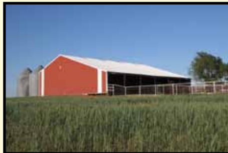
Blacktop Road Access!