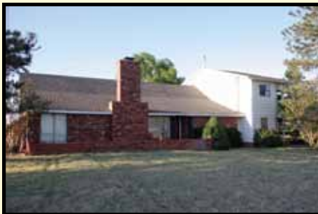
2780 Sq. Ft. Remodeled Home!

Saturday, May 14th from 10:00 A.M. to 12 Noon and Monday, May 16th from 6:00 P.M. to 8:00 P.M.