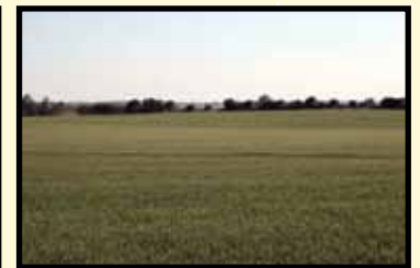
Total Electric Pump and Center Pivot!