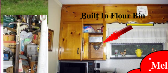
Built In Flour Bin