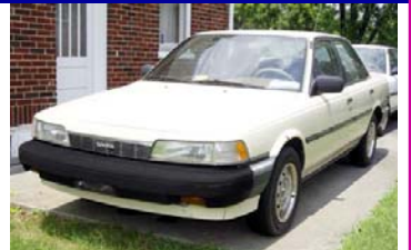
87 Toyota Camry

Personal Property WILL be sold including vehicles, tools, many antiques, glassware, N&W items, furniture, household items, yard implements, 3 cedar wardrobes, and so much more.