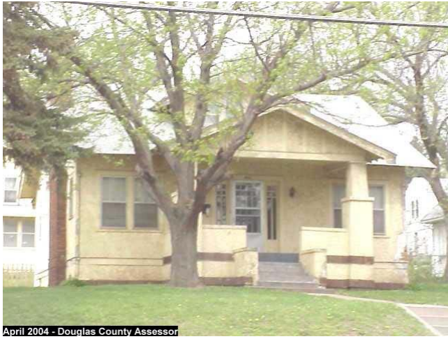
April 2004 - Douglas County Assessor