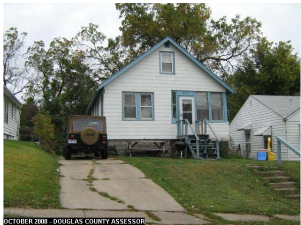
OCTOBER 2008 - DOUGLAS COUNTY ASSESSOR