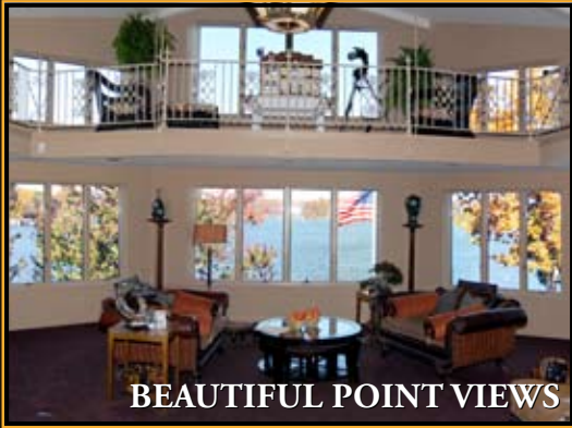
BEAUTIFUL POINT VIEWS