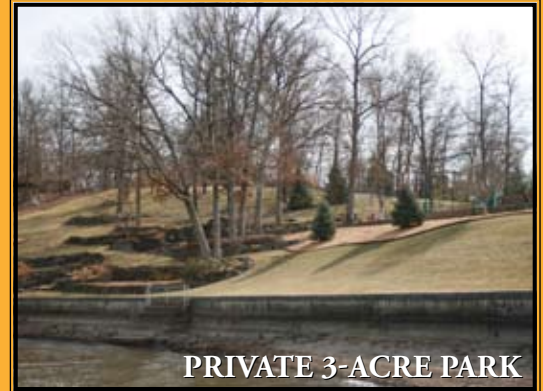
PRIVATE 3-ACRE PARK