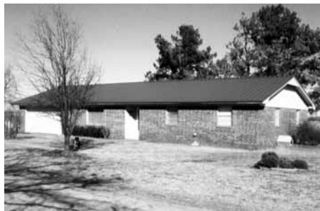
BRICK HOME - 1630 SQ. FT.

2 Mi. West of Hwy. 81 on CR 2850. Pretty Little Ranch with 5/16 mile Blacktop Road Front. Bob and Sue have bought an acreage in Comanche Co. to be near their grandkids - Selling all listed.