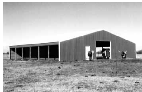
NEW BARN 60' X 60'