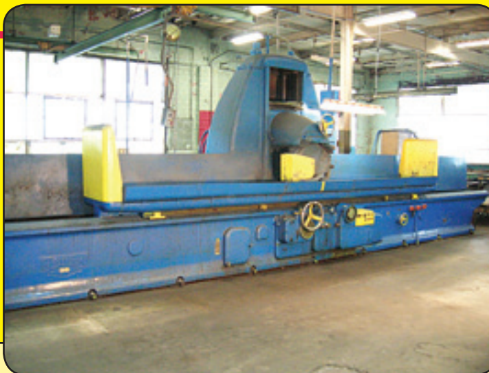
Mattison 18" X 18" X 196" Surface Grinder