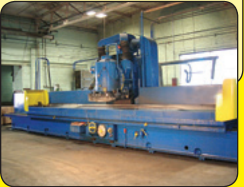
Hill Acme 30" X 30" X 240" Surface Grinder

DIRECTIONS: From I-75 in West Central Ohio, take Exit 111, Bellefontaine St./Rt. 501. Go west off ramp on Bellefontaine St., 1-1/10 mile to Water St. Turn right (north) onto Water St, Go 1/10 mile to North St. Turn left (west) onto North St. Auction Site immediately on Right Hand Side, 300 North St., Wapakoneta, Ohio. Watch for Signs!