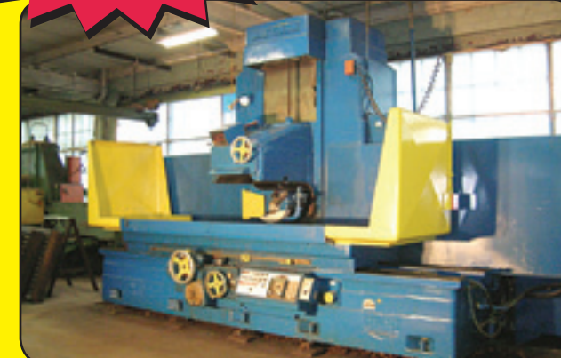
Mattison 36" X 36" X 72" Surface Grinder

LOCATION CLOSING COMPLETE LIQUIDATION!!!