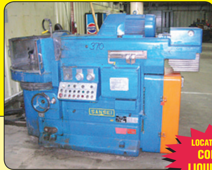
Sansen 20" Rotary Surface Grinder