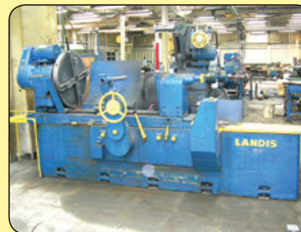
Landis 30" X 48" Universal ID/OD Grinder