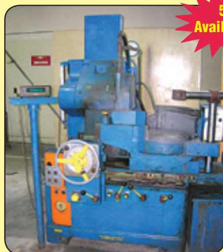
Heald Rotary Surface Grinder (1 of 5)