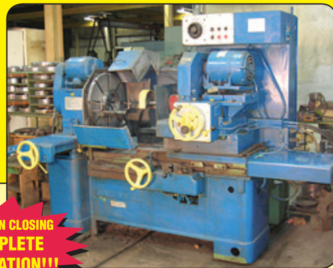
Cincinnati Heald 273A Internal Grinder

LOCATION CLOSING COMPLETE LIQUIDATION!!!