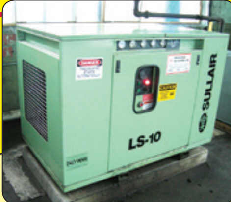
Sullair Rotary Screw Air Compressor