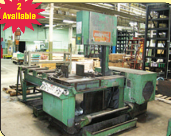
Marvel #81 Tilt Frame Vertical Band Saw (1 of 2)