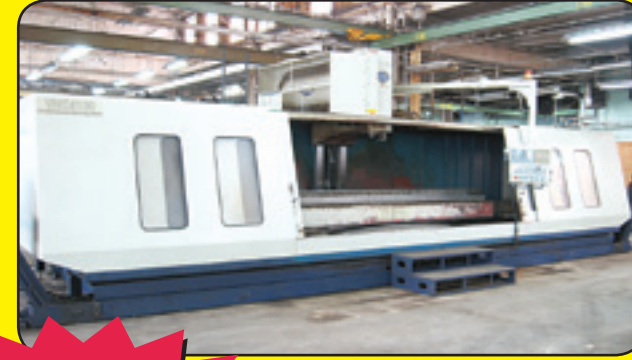
Mighty Viper Model VM4100 Long Bed CNC Vertical Machining Center