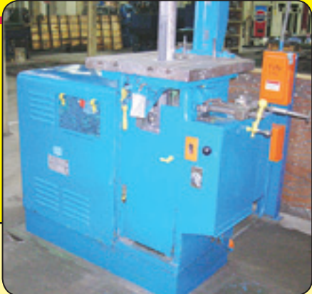
Mitts and Merrill Hydraulic Keyseater