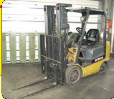
Caterpillar 4,600 Lb. Capacity Forklift