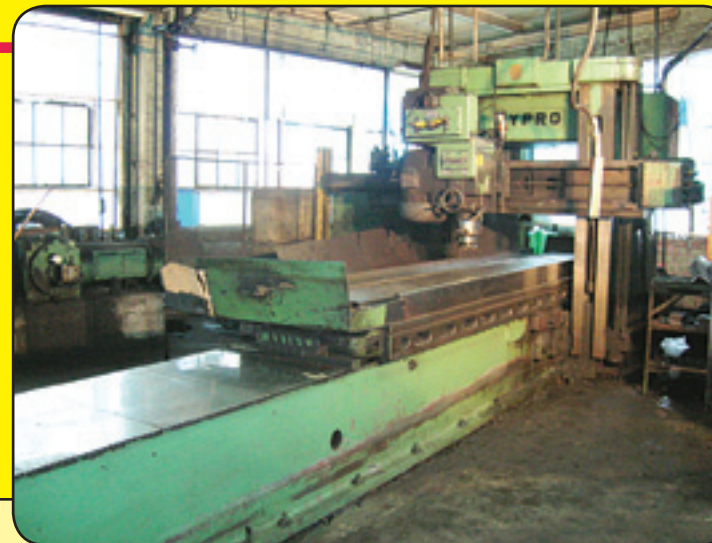
Giddings and Lewis Hypro "Futurmill" Planer Mill