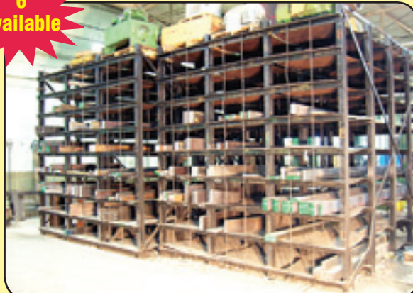
Steel Storage Cube (6 Available)