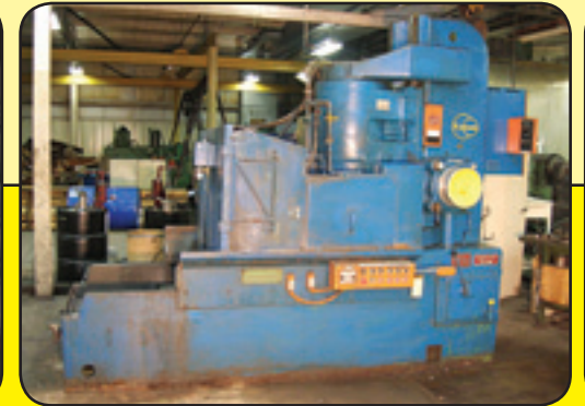
Blanchard Model 22D-42 Rotary Surface Grinder