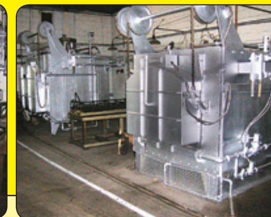
Bank View, Lindberg Heat Treat Furnaces