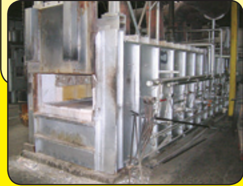
Exothermic Natural Gas Batch Heat Treat Furnace

1,000's of Pounds of Scrap Metal -- Great Buying Opportunity