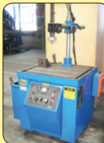
Unitek Tap Disintegrator