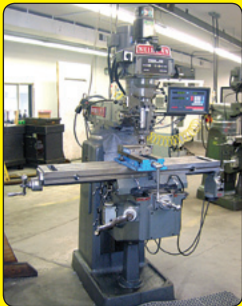
Seiki Model 3VH Vertical Mill