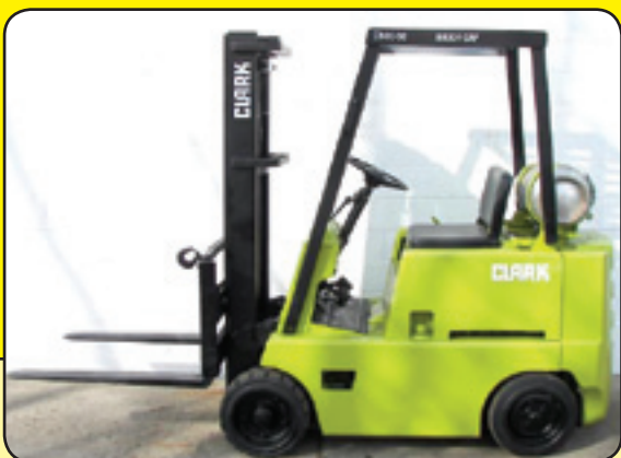
Clark Model C00-45 Fork Lift