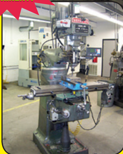
Seiki Model 2VS Vertical Mill

SURPLUS DUE TO RE-ORGANIZATION • VERY CLEAN, WELL-MAINTAINED MACHINERY!