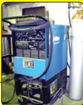
Miller Tig Welder