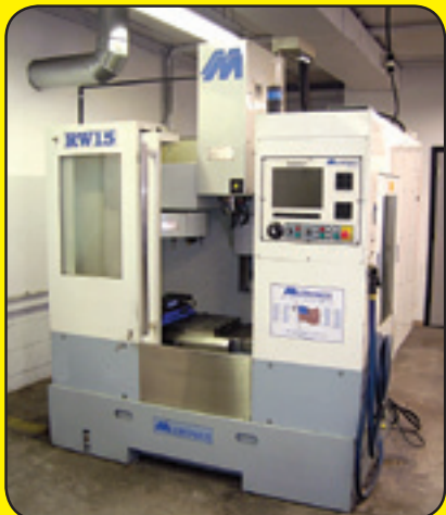
2004 Milltronics RW15 CNC Vertical Machining Center