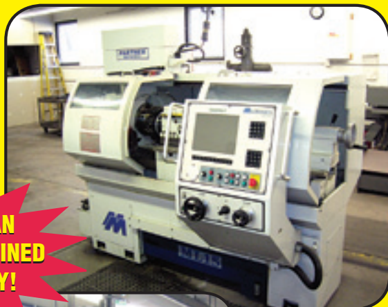
2005 Milltronics ML15 CNC Toolroom Lathe