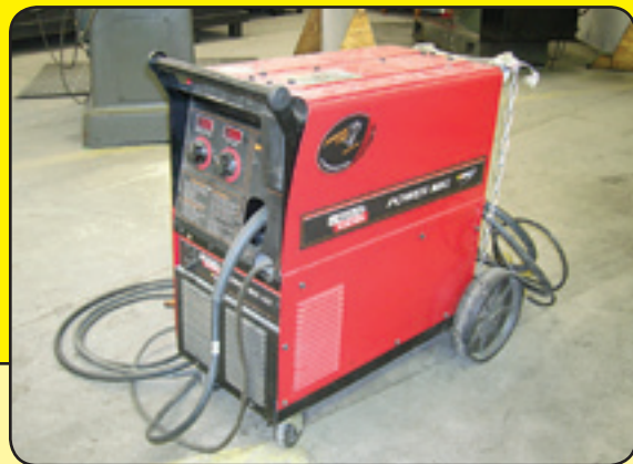
Lincoln Mig Welder