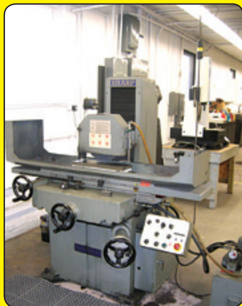
Sharp 618 2-Axis Hyd. Surface Grinder