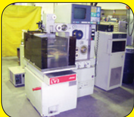
Japax 4-Axis CNC Wire EDM