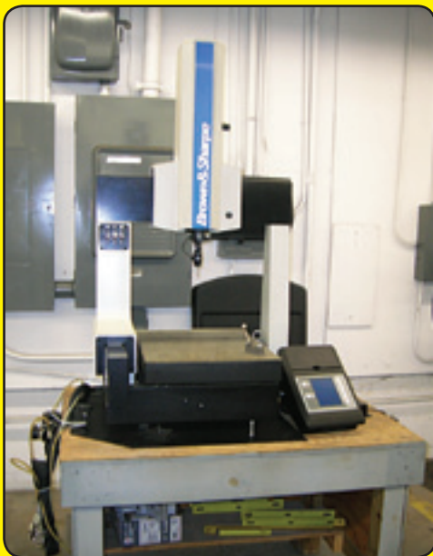
Brown & Sharpe Coordinate Measuring Machine