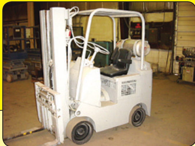
Towmotor 3,000 Lb. Forklift