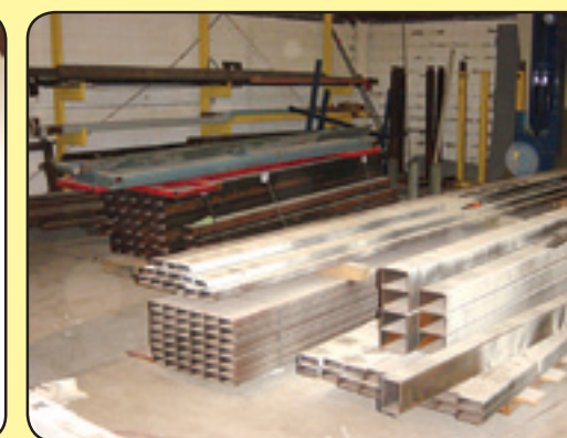
Partial View, Structural Steel