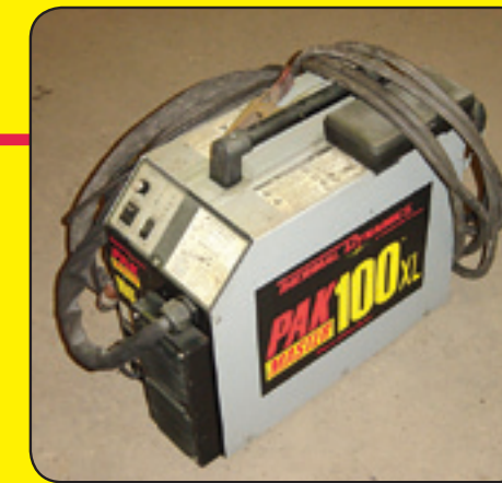
Thermal Dynamics Pak Master 100XL Plasma Cutter