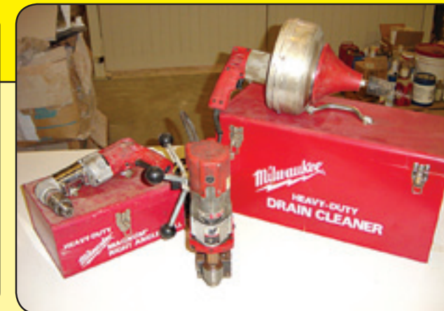
Partial View, Power Tools