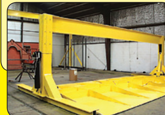
6 Ton Hydraulic Mold Lift and Fixture Press

Free Standing Cranes • Galion All-Terrain Crane • Forklifts • Scissor Lifts Welders • Fixtures • Jigs • Power Tools • Hand Tools • Gusmer Pumps Building Materials • Many Other Items