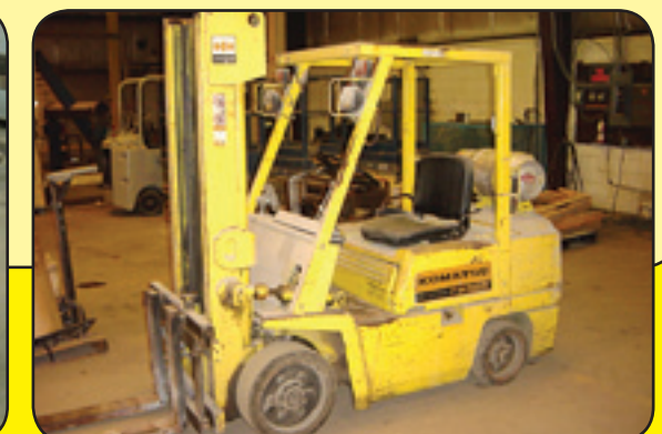
Komatsu 5,500 Lb. Forklift

DIRECTIONS: From Eastbound I-70 in Columbus, Take Exit 103B, Alum Creek Drive/Livingston Avenue. Turn Right at end of Exit Ramp onto Alum Creek Drive. Go 2/10 Mile to Livingston Avenue, Turn Left (West) onto Livingston Avenue. Auction site immediately on Left Hand Side, 1909 E. Livingston Ave. Watch for Signs!