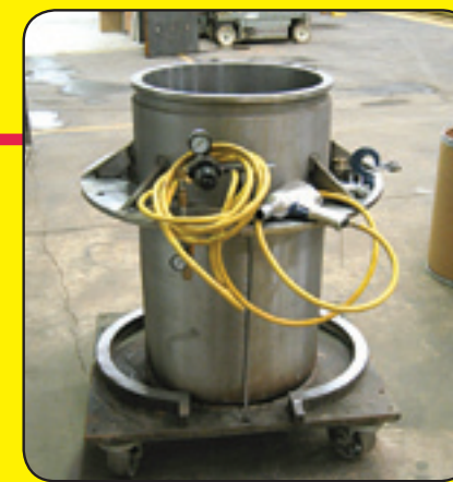
Stainless Steel Resin Pump System (Several Available)