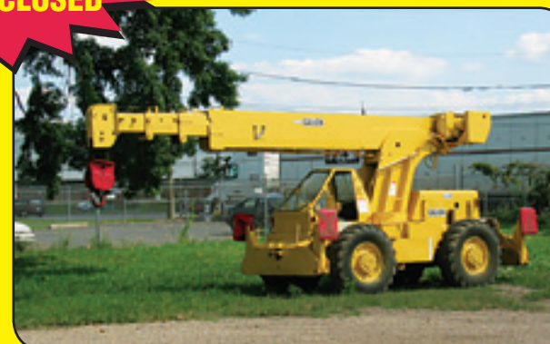
Galion 125A All-Terrain Crane