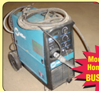
Miller Mig Welder (1 of 2)

Modular Composite Home Manufacturer BUSINESS CLOSED