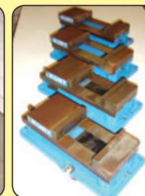
Partial View, Kurt Vises