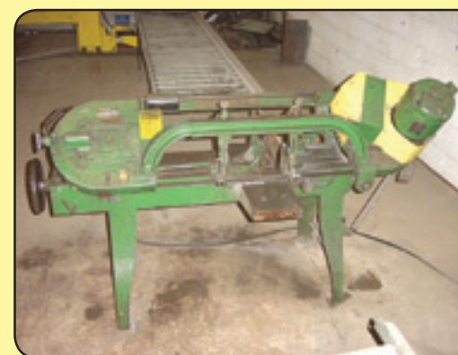
Wells Model 8M Horizontal Band Saw