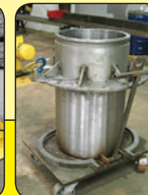
Stainless Steel Resin Pump System (Several Available)