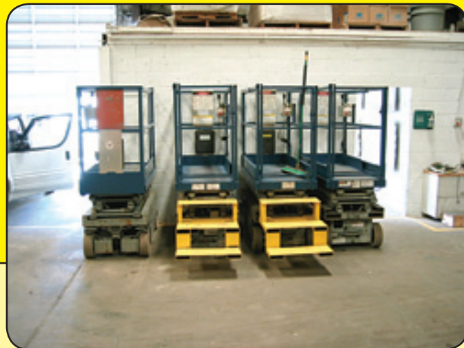
Sky Jack Scissor Lifts (4 Available)