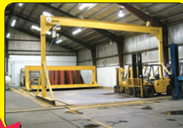
3 Ton Gantry Crane with Drive Train and Track

Modular Composite Home Manufacturer BUSINESS CLOSED