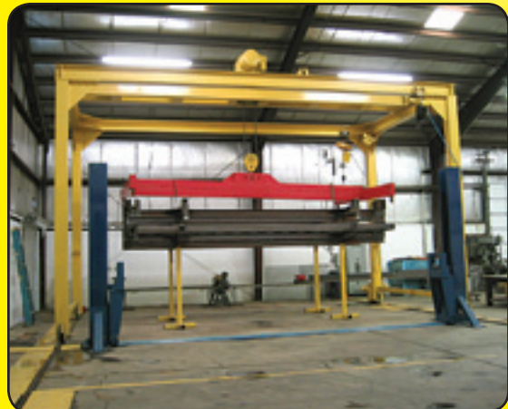
10 Ton Free Standing Crane System with Drive Train and Track