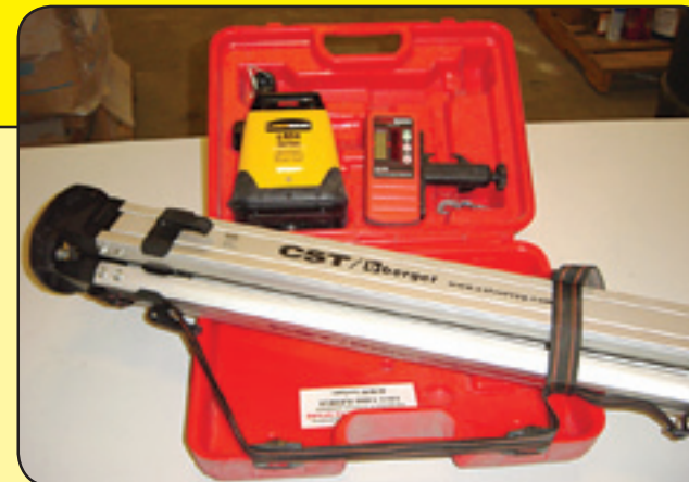
Laser Mark/Berger Precision Level