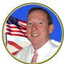
Tommy Praytor Revenue Commissioner