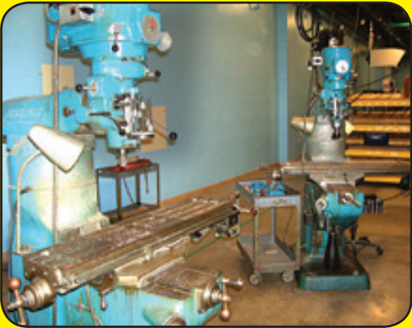
Bridgeport Vertical Mills, 1-1/2 HP, Vari-Speed

Inspection: Morning of auction, 8:00 a.m. - 10:00 a.m.