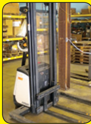
Crown Electric Lift, Model ST 3000-20