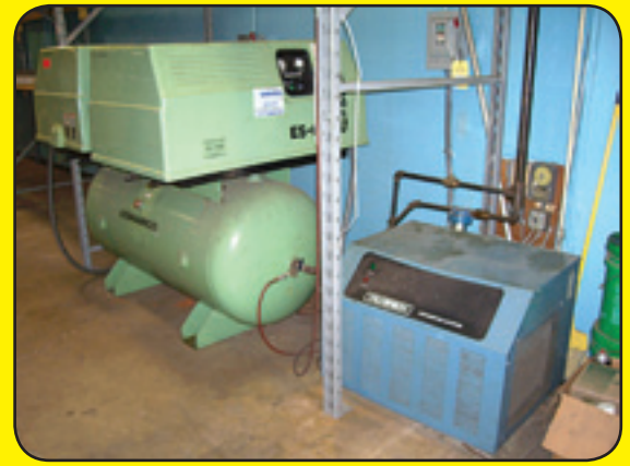
Sullair ES-6 Twin Pac Air Compressor & Wilkerson Refrigerated Air Dryer