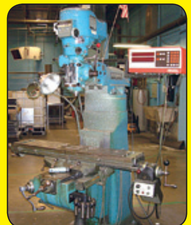
Bridgeport Series I, 2 HP, with Pathfinder DRO, s/n 4170178