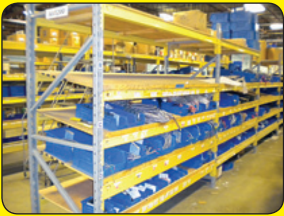
Pallet Shelving 8' X 8" X 3" (47 Sections)