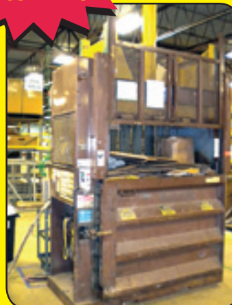
SP Industries Cardboard Compactor, Model VB-60-E, s/n 95040605

PLANT CLOSING DUE TO FACILITY CONSOLIDATION