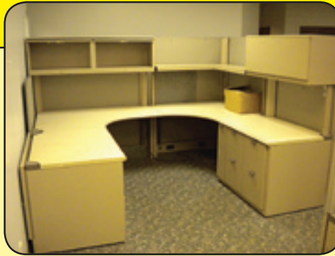
25 Steel Case 'Office Context System', Office Cubicles with overhead storage