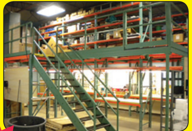
Mezzanine 26' X 13' X 8' New in 2008

FOR AUCTION INFORMATION CONTACT KENT JONES: 937-320-1900