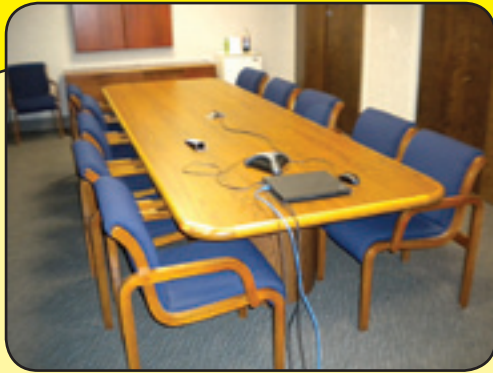
Conference Table 12' X 4' with 10 Chairs