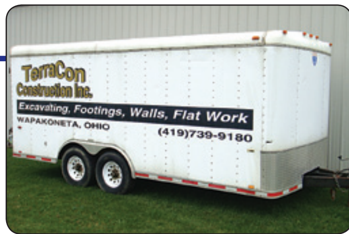
Tandem Axle Box Trailer