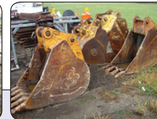
Various Excavator Buckets