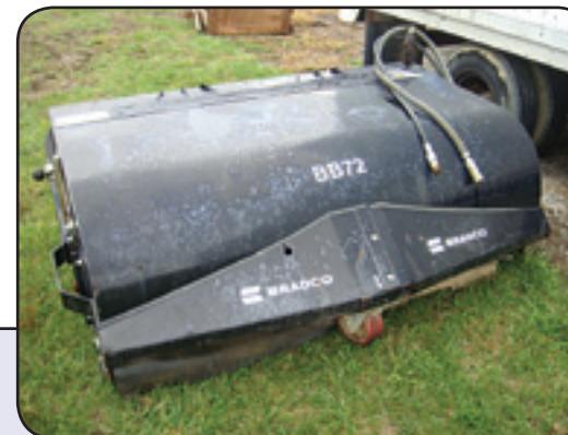
Bradco Skid Loader Broom Attachment