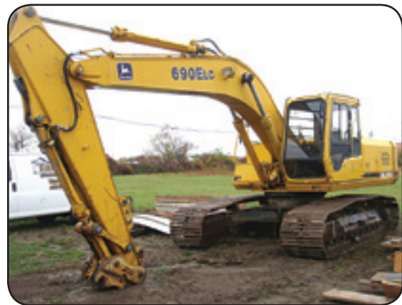
John Deere 690 ELC Excavator