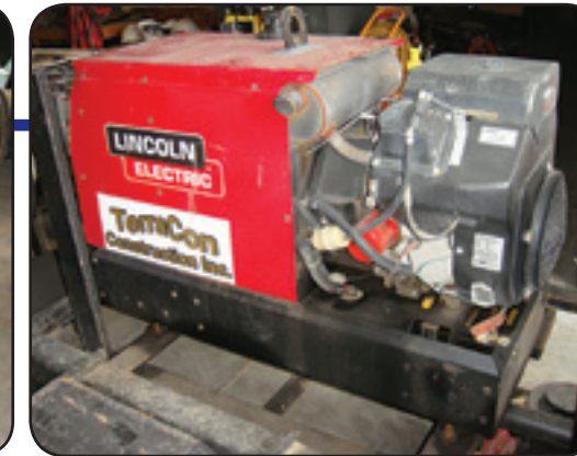
Lincoln, Trailer Mounted, Welder Generator