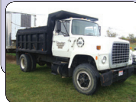
Ford 8000 Single Axle Dump

John Deere 690 ELC Excavator • Semi-Tractor • Dynaweld 25 Ton Gooseneck • Pick-Up Trucks Trailers • Work Vans • Lincoln Welder/Generator • Huge Quantities of Power Tools • Lasers & Transits Pumps & Generators • Somero Copperhead Laser Screed • Bobcat 773 Skid Loader • Soft-Cut Concrete Saws Huge Quantity of Concrete Forms & Accessories