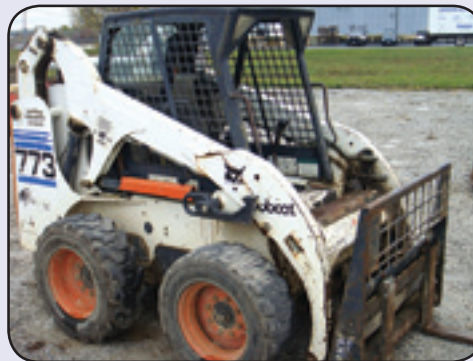
Bobcat 773 Skid Steer