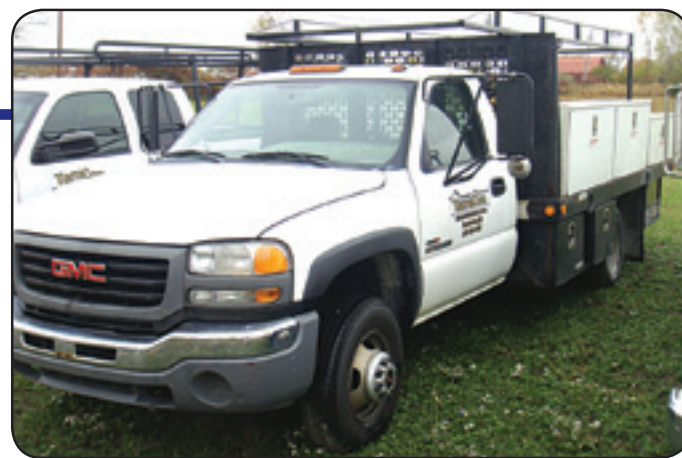
-2004 GMC Stake Bed