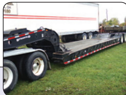
2000 Dynaweld 25-Ton Detachable Gooseneck