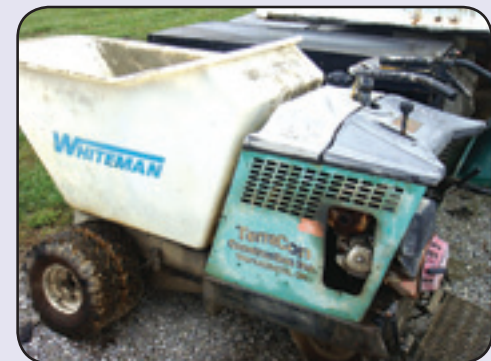
Whiteman Concrete Buggy