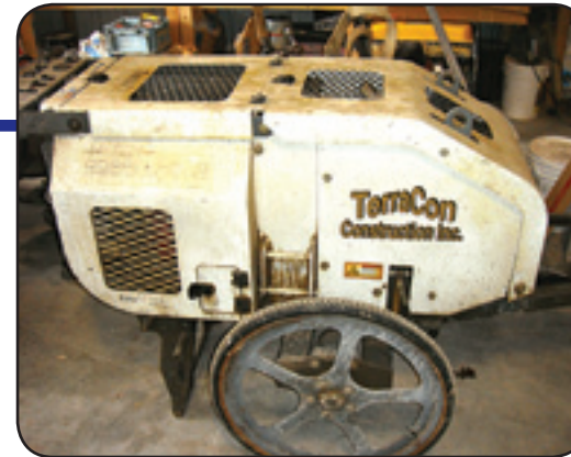
Somero Copperhead Model S-9210 Laser Screed