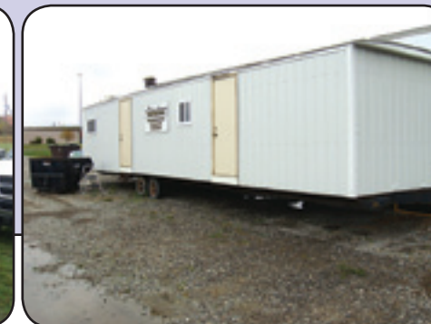
Job Site Office Trailer