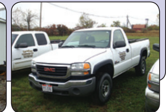
-2000 GMC Pick-Up

DIRECTIONS: From I-75, about 50 miles north of Dayton, Ohio, get off at exit #111 (The Bellefontaine and Wapakoneta Exit) and go one block west to Apollo Drive. Turn left (south) on Apollo & go 100 yards to Lunar Dr. & Go Right 1/8 mile to auction site on right.