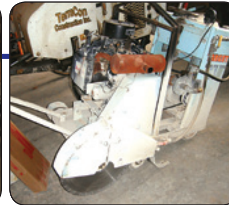
Concrete Power Saw