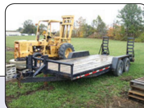
Tandem Axle Equip. Trailer & Rough Terrain Forklift