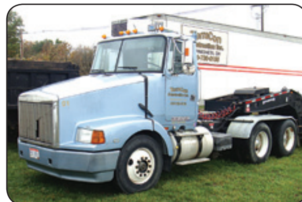
1994 Volvo Semi-Tractor

www.thompsonauctioneers.com • Ohio License #63199566109