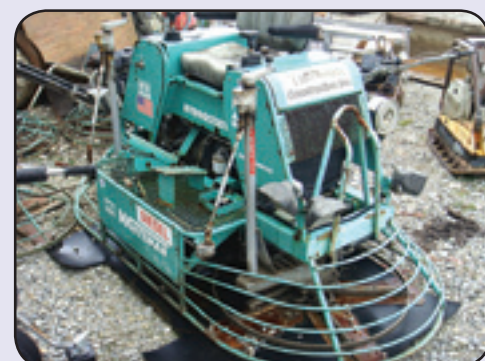
Whiteman Hyd. HTH Series Diesel Power Trowel