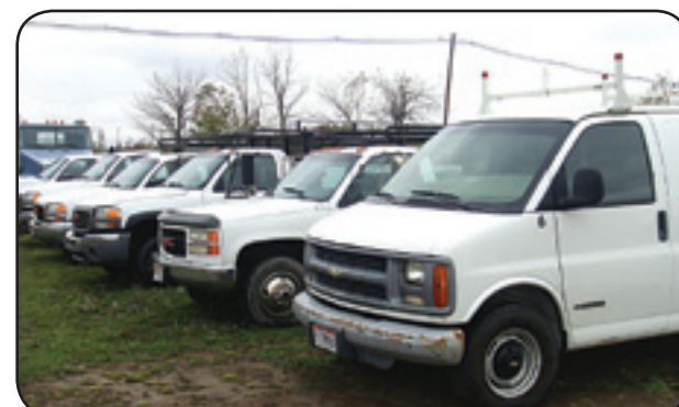
-Large Quantity Pick-Ups, Service Vans