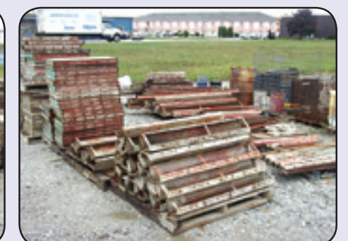
Large Quantity of Concrete Forms