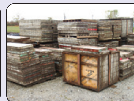
Large Quantity of Concrete Forms