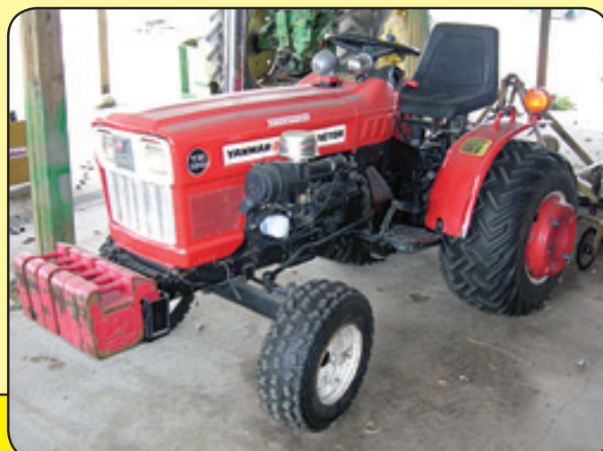
Yanmar YM186 Turbocharged Diesel Tractor