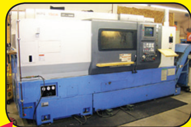
1998 Mazak Super Quick Turn 30MS CNC Turning Center with Milling

Business Closed VERY CLEAN CNC AND TOOLROOM FACILITY!