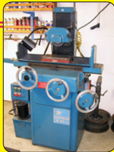
K.O. Lee 6" X 12" Surface Grinder