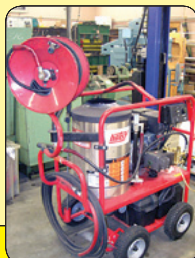
Hotsy Steam Cleaner