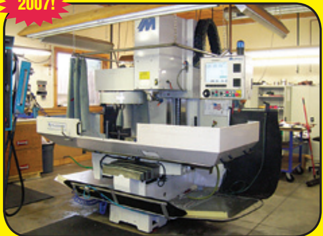
2007 Milltronics RH20 CNC Vertical Machining Center