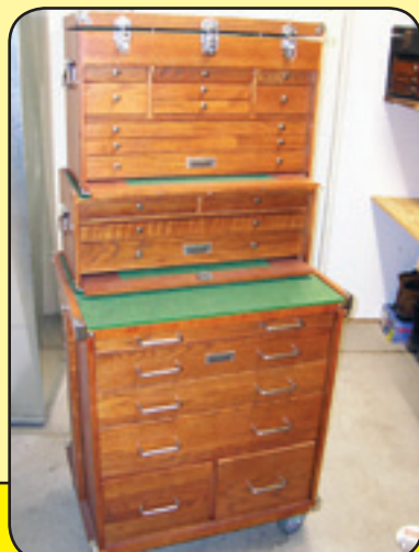
Gerstner Wooden Machinist Tool Box

BIDSPOTTER TERMS: If you are bidding on the internet thru www.bidspotter.com , the terms are as follows: A 15% Buyer's Premium is in effect. Internet bidders must register with a credit card. If you are the successful bidder your credit card will be charged as follows: For amounts less than $5,000, the entire balance is due immediately with your credit card. For amounts greater than $5,000, a 25% deposit will be due immediately and the remaining balance is due within 48 hours either by cash, check, Visa, MC or Discover, or wire transfer. IF YOU CANNOT ATTEND: Bid Live, Online at www.bidspotter.com or Fax to our office the items you want to bid on with you want to bid on with your max price and we will bid on your behalf. Please include a credit card number for downpayment in the event you are the successful bidder. Fax #: (937)376-8328