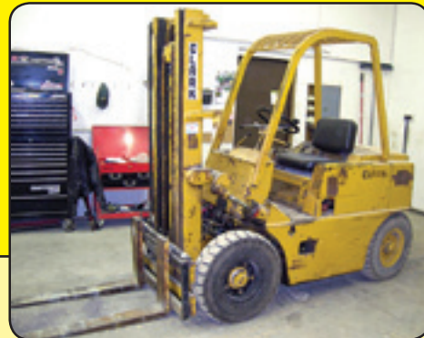
Clark All-Terrain Fork Lift