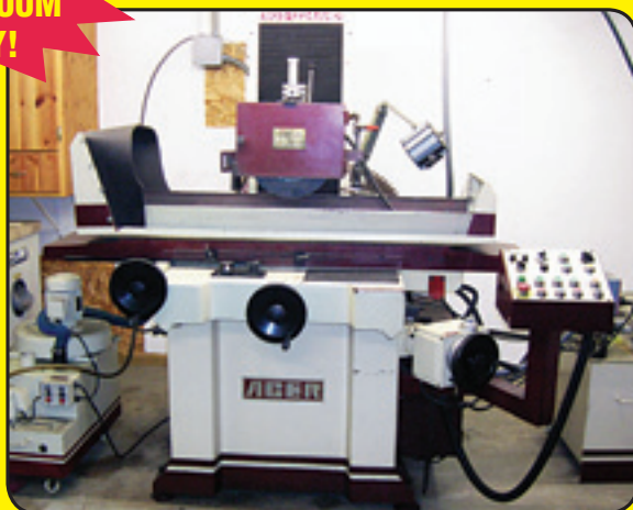
Acer 12" X 24" Fully Automatic Surface Grinder