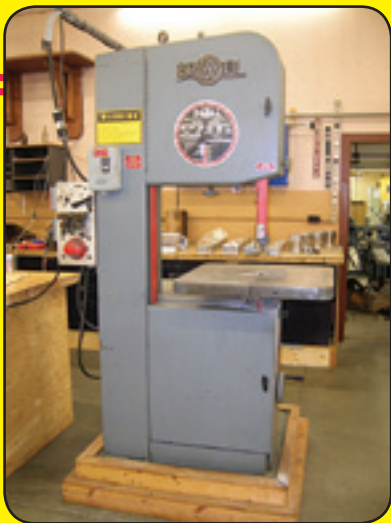
Do-All Vertical Band Saw