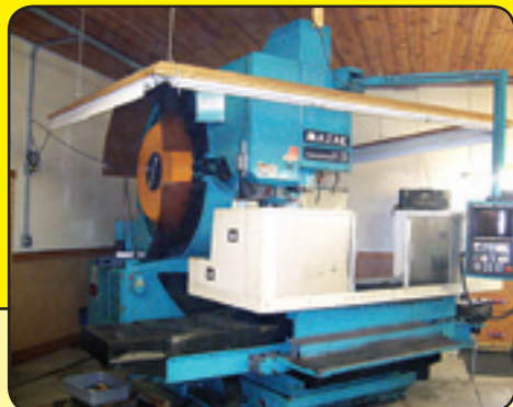
Mazak PowerCenter V-20 Vertical Machining Center