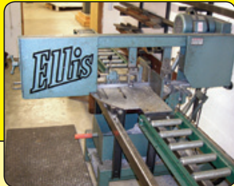
Ellis Mitre Cut Horizontal Band Saw