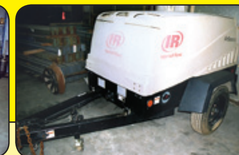
Ingersoll-Rand "Air Source"