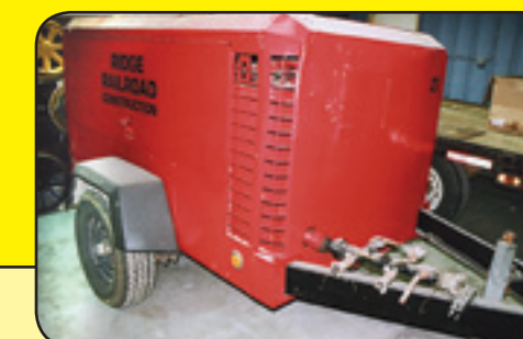
"Sullivan Palatek" Portable Air Compressor