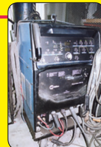
Miller Syncrowave 250