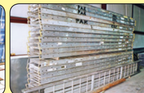
Aluminum Walk Boards