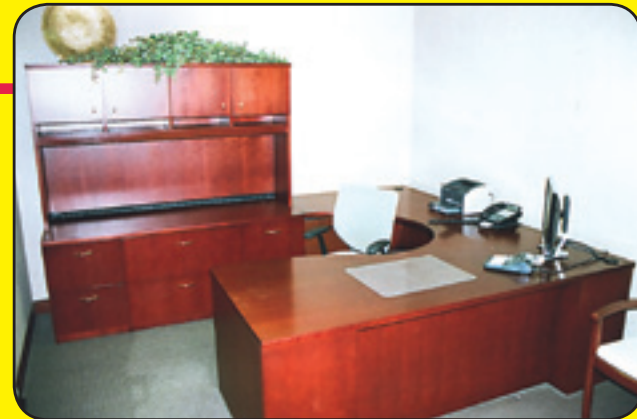
Cherry Office Furnishings