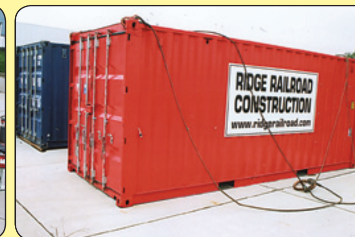
(3) Steel Containers