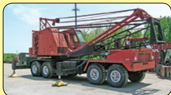
Link Belt Crane, 40 ton capacity