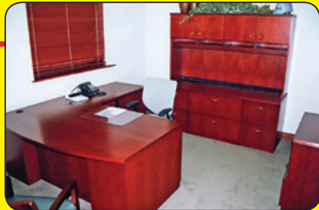
Cherry Office Furnishings