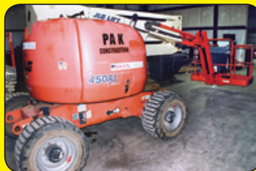
JLG Boom Lift