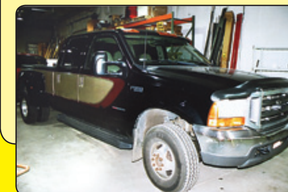
Ford F-350 Dually