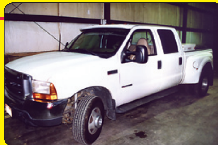
Ford F-350 Dually "Super Duty"