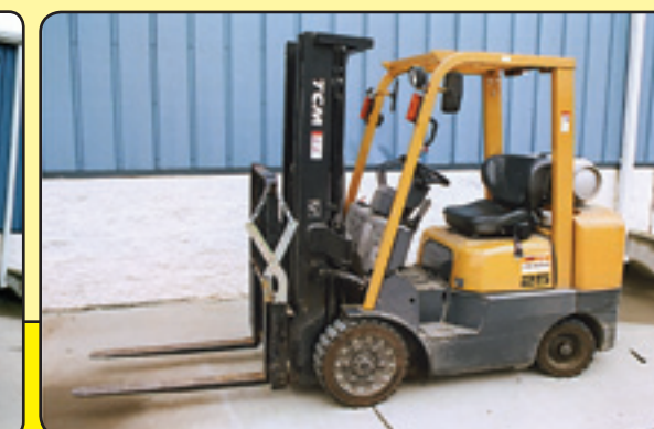
TCM 4300 Lb. Forklift

DIRECTIONS: From I-75 & I-275 on the North Side of Cincinnati, Go West on I-275 to Route 4 and go north on Route 4. Go 2.8 miles north on route 4 to Homeward Way & Go Right to the auction site ¼ mile.