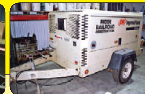
Ingersoll-Rand Port. Air Compressor, 375 CFM