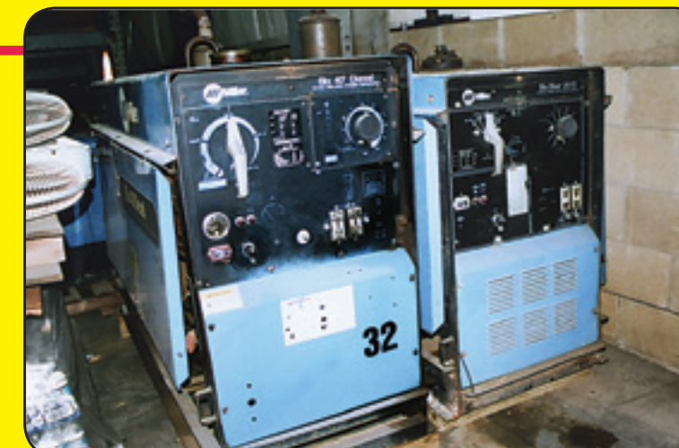
(2) Miller Diesel Welder/Generators