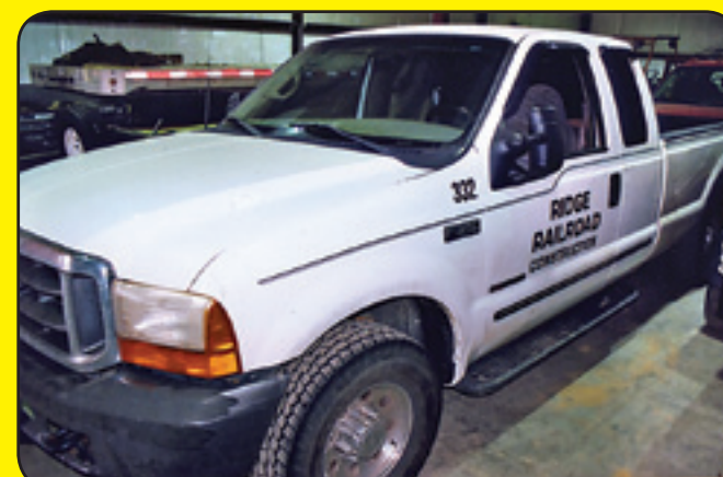
Ford F-350 Club Cab