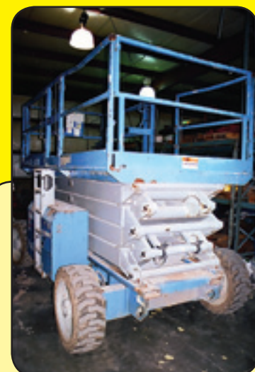
Genie Scissor Lift