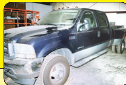
Ford F-350 Dually "Super Duty"