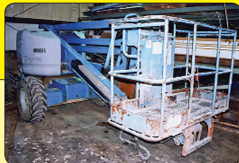
Genie Boom Lift