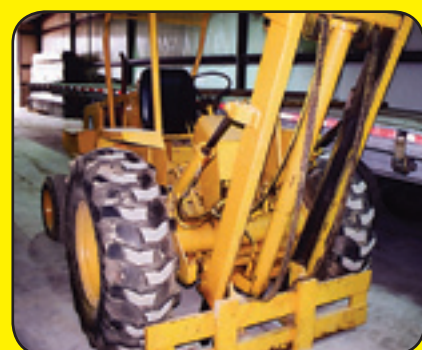
Allis Chalmers Rough Terrain Fork Lift