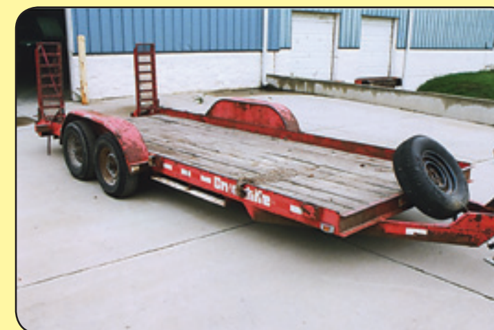
Cronkite Equipment Trailer