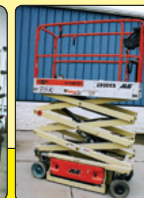
(1) of (2) JLG Scissor Lifts