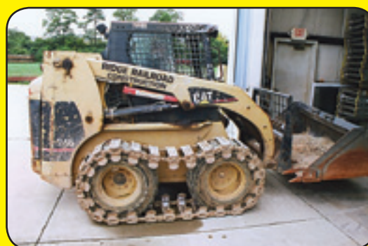
Cat Skid Steer