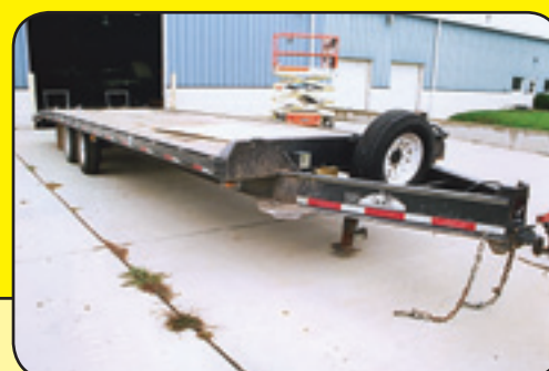
Tandem Axle Trailer