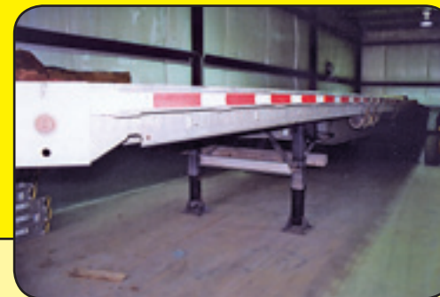
2004 Ravens Alum. Semi-Trailer, 52 Ft.