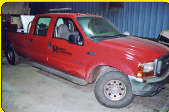
Ford F-350 "Super Duty"