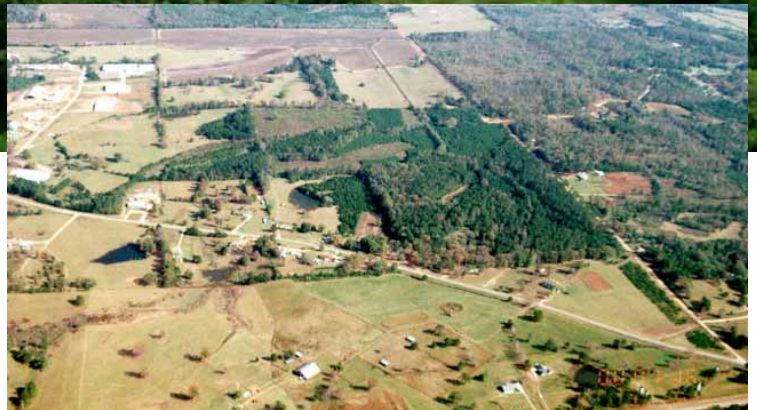
Top: This aerial photograph shows some of the available land in the site. Insert: This aerial photograph shows the site and surrounding property.

Kosciusko is located in central Mississippi approximately 21 miles east of Interstate 55. This industrial park is owned by Attala County.